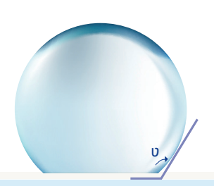
Siliconized surface: \upsilon > 95^{\circ}